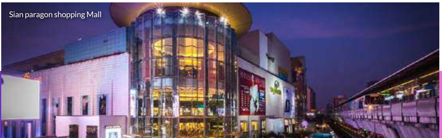
Siam paragon shopping Mall

These are just a few highlights, as Dubai offers a wide range of attractions and experiences for visitors of all interests.