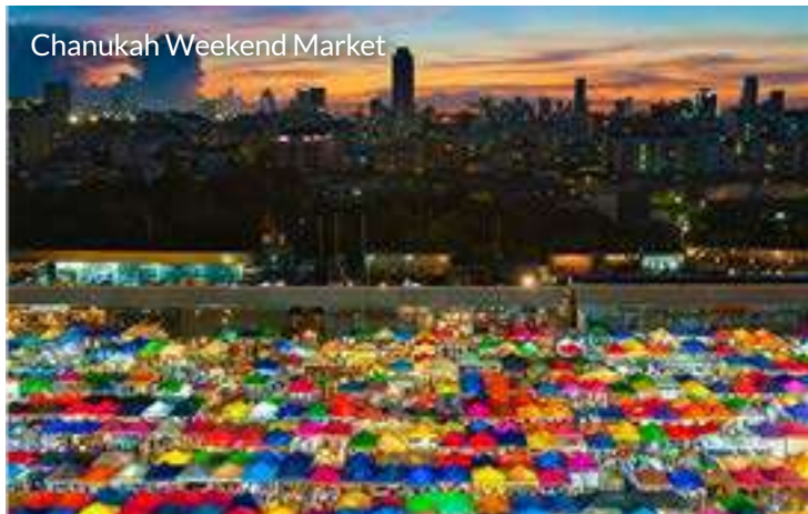
Chanukah Weekend Market