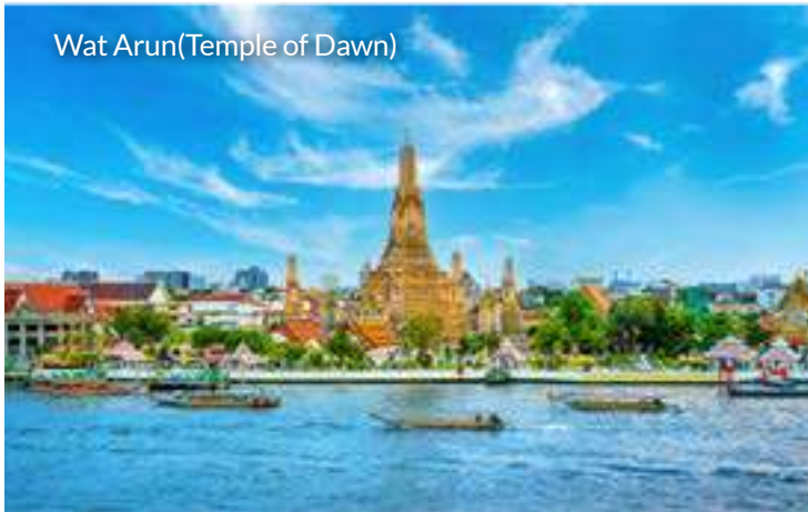
Wat Arun(Temple of Dawn)