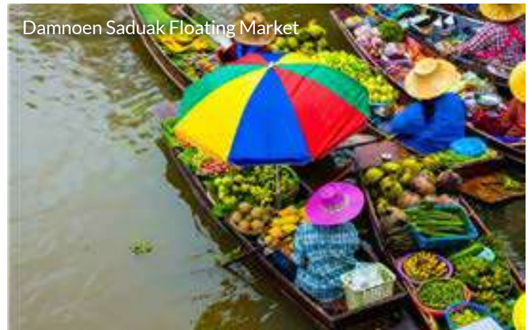
Damnoen Saduak Floating Market