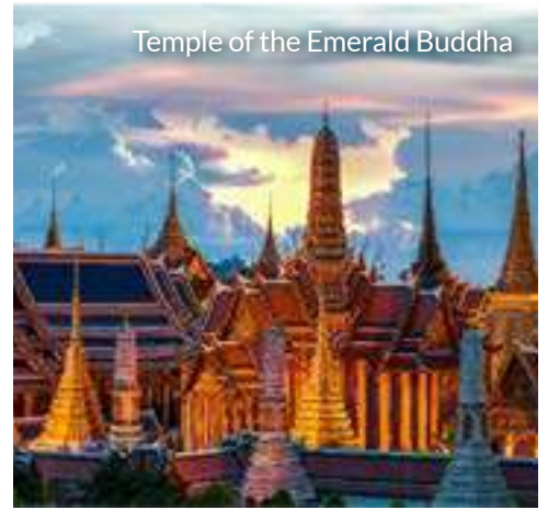
Temple of the Emerald Buddha