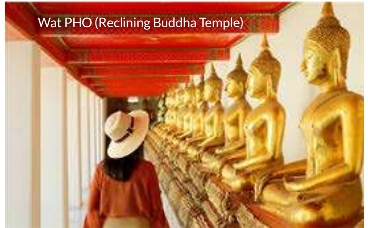
Wat PHO (Reclining Buddha Temple)